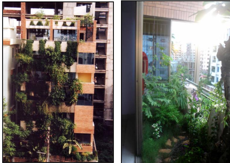
Figure 1: Green application on Building in dense Dhaka city

Green attachment of residents with green verandah in building is participation of urban residents with physical and leisure activities. The quality of physical properties and attributes of the green landscapes including diversity of spaces, and enriches the experiences of users. Studies of place attachment have also focused on people's use of particular places for self and emotion regulation (Korpela and Hartig, 1996). Residents perceive the green space as their favorite place that affords residents relaxation and relief from mental stress. Green roof and green verandah is a place for them to perform physical activity with privacy, safety and security. This is a favorite place, which appears to afford restorative experiences that aid emotion- and self-regulation processes. For example, studies indicated that favorite place is visited to relax, calm down and clear minds (Korpela, 1992).